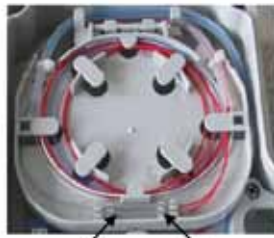
Splice protective sleeves Splice secure clips